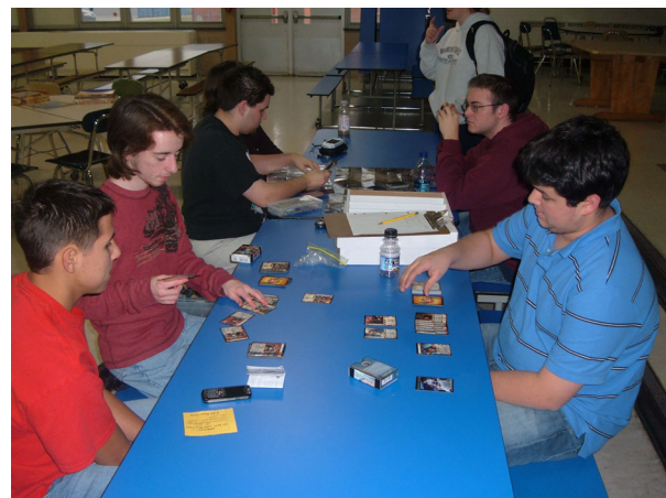
Members of the Game Club play games that range from classic board games like Risk and Monopoly, to the latest collectible card games.