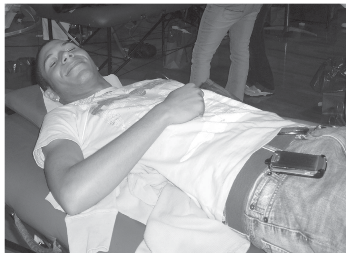
Two of the many anticipated events run by Interact are the bi-annual blood drives. As with most Interact activities, it offers students the opportunity to serve their community.

The school day at Washington Township High School does not end after the eighth period bell. Everyone can find something interesting to do after school within the multitude of clubs and organizations offered after school. Whether you're interested in technology, community service, or poetry, there is something that can interest anyone.